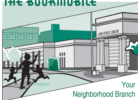
Your Neighborhood Branch