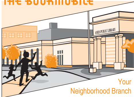
Your Neighborhood Branch