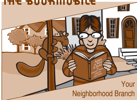
Your Neighborhood Branch