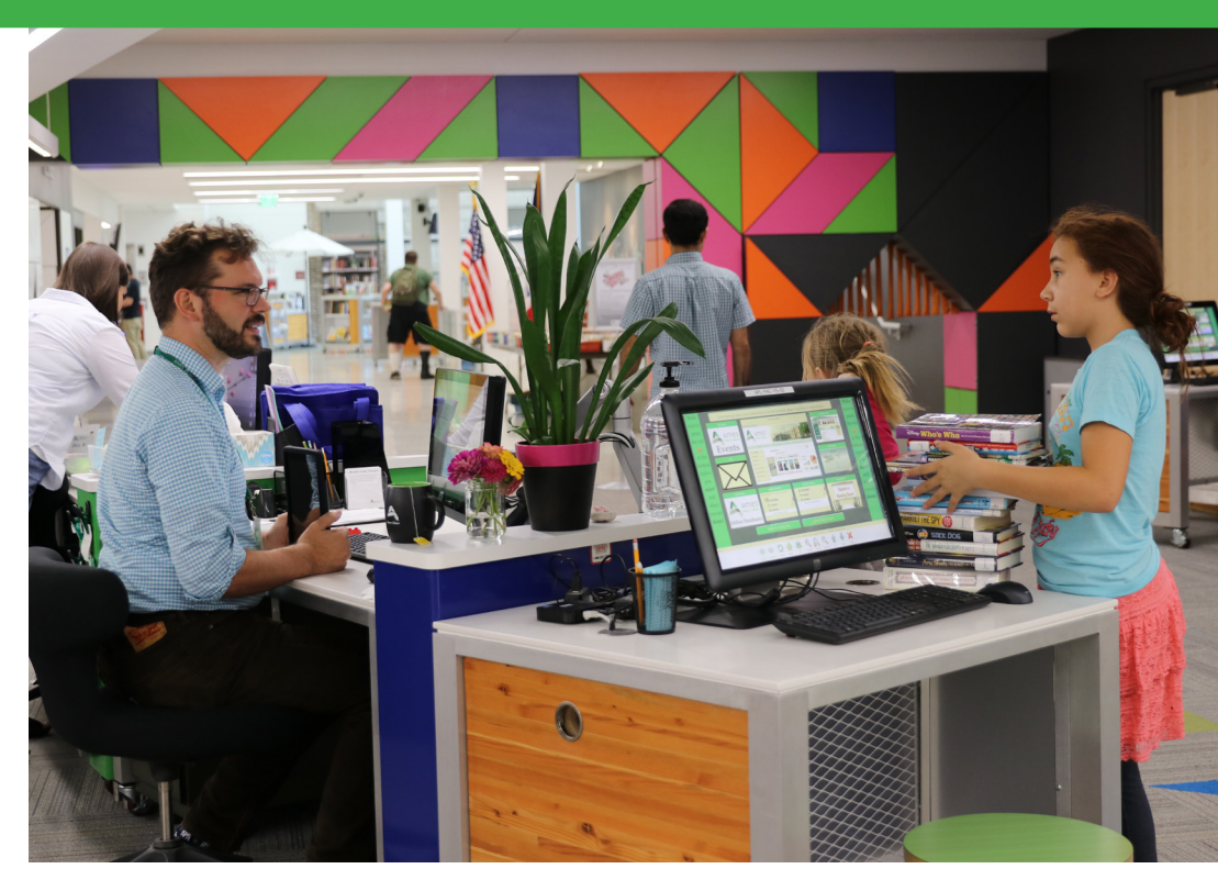
The Library's dedicated children's area.

ETP values include: committing to continuous improvement, inspiring creativity and innovation, being customer driven, making data-driven decisions, championing employee involvement, striving for excellence, promoting fiscal stewardship, acting with honesty and integrity, exhibiting leadership, choosing a positive attitude, respecting one another, promoting safety and wellness, and cultivating teamwork.