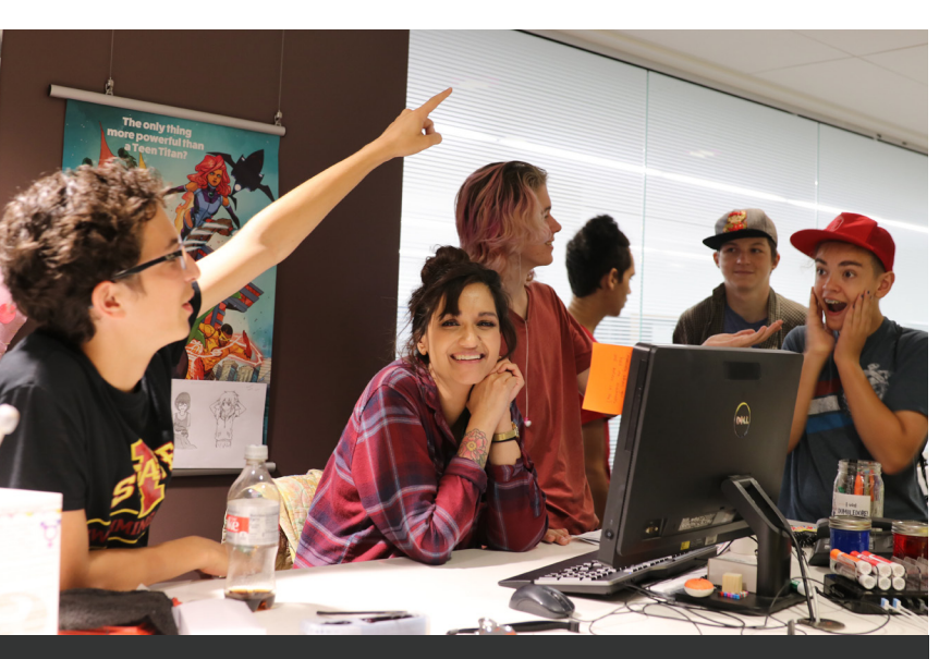
Above, the Library's dedicated teen space.